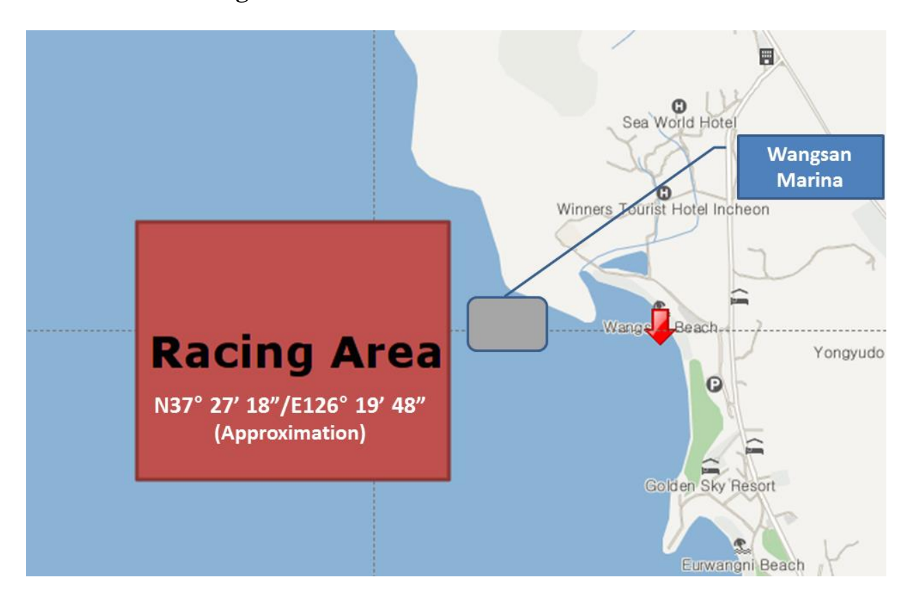
3 Racing Areas